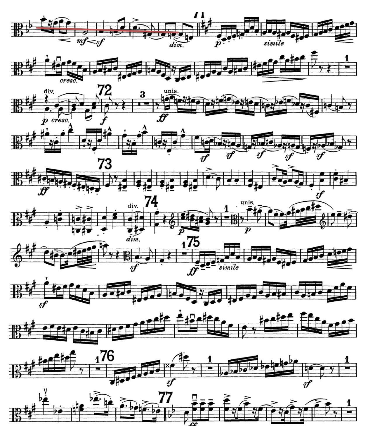
ELGAR Symphony No 1: Figure 71 – 4<sup>th</sup> Bar of 77