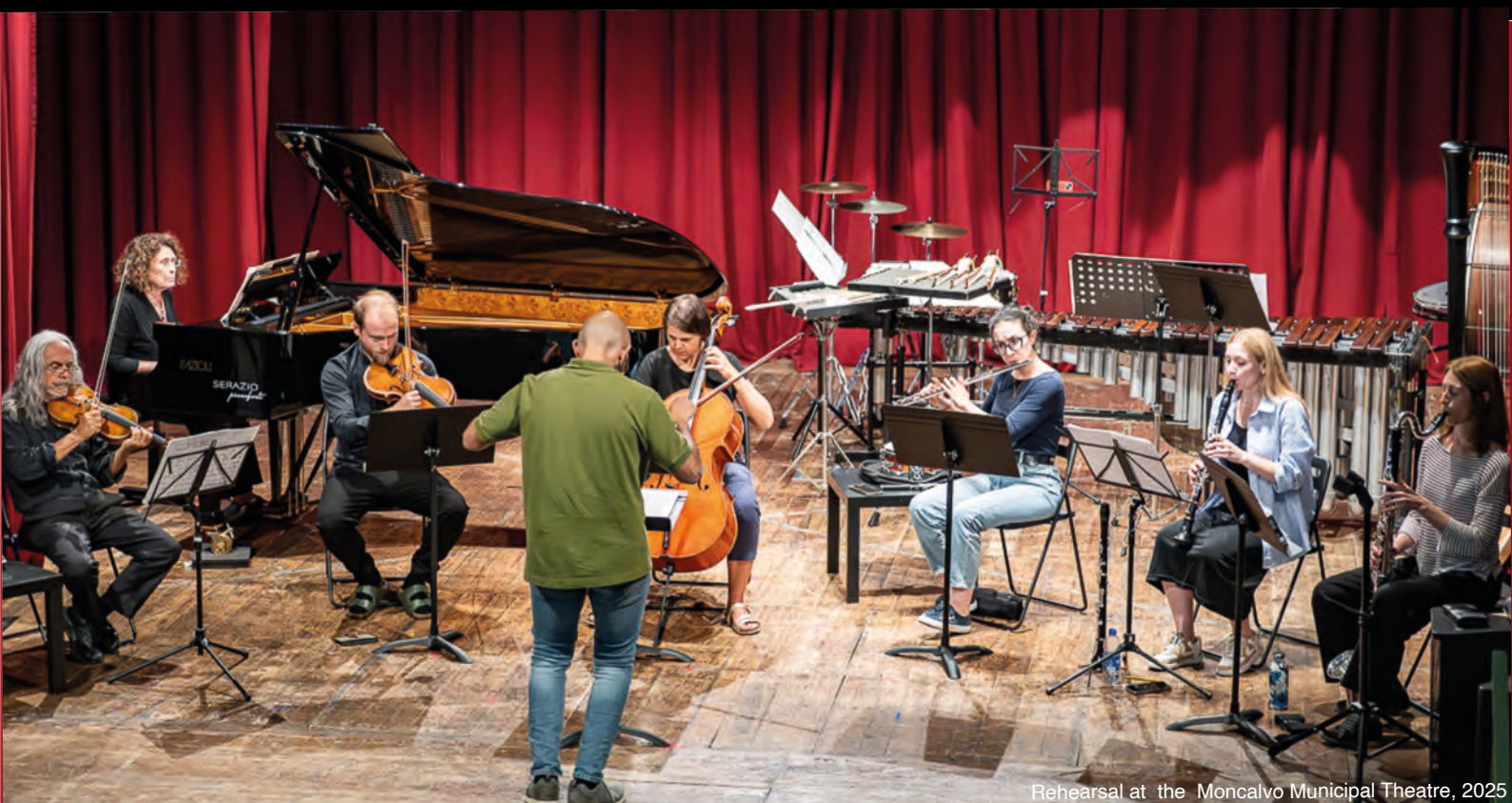
Rehearsal at the Moncalvo Municipal Theatre, 2025