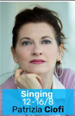
Singing 12-16/8 Patrizia Ciofi