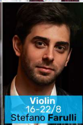
Violin 16-22/8 Stefano Farulli