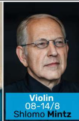
Violin 08-14/8 Shlomo Mintz