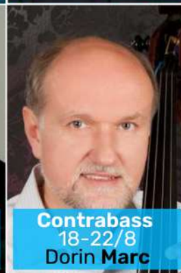
Contrabass 18-22/8 Dorin Marc