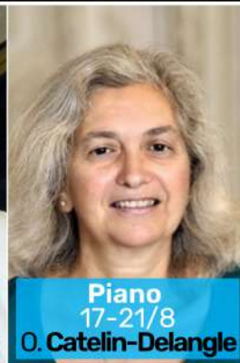
Piano 17-21/8 O. Catelin-Delange