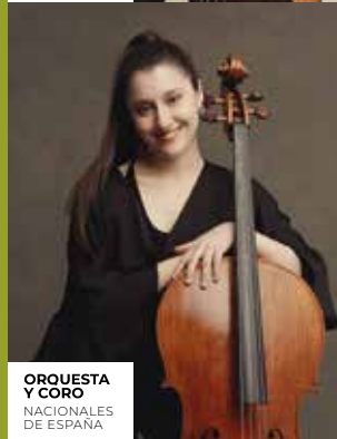
ORQUESTA Y CORO NACIONALES DE ESPAÑA