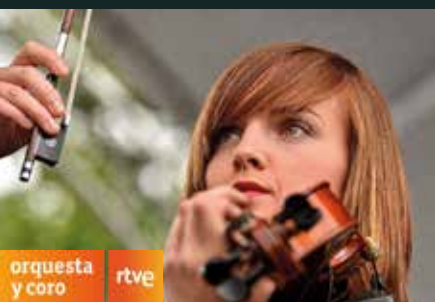
ORQUESTA Y CORO rtve