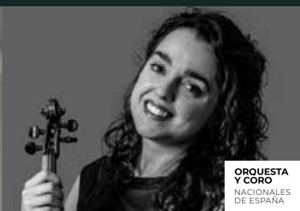
ORQUESTA Y CORO NACIONALES DE ESPAÑA