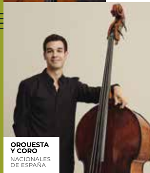
ORQUESTA Y CORO NACIONALES DE ESPAÑA