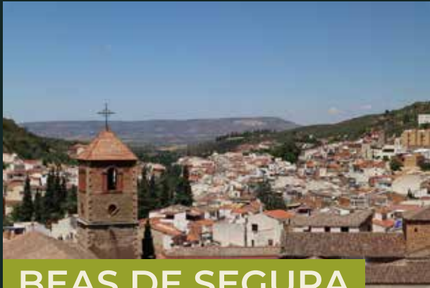
BEAS DE SEGURA