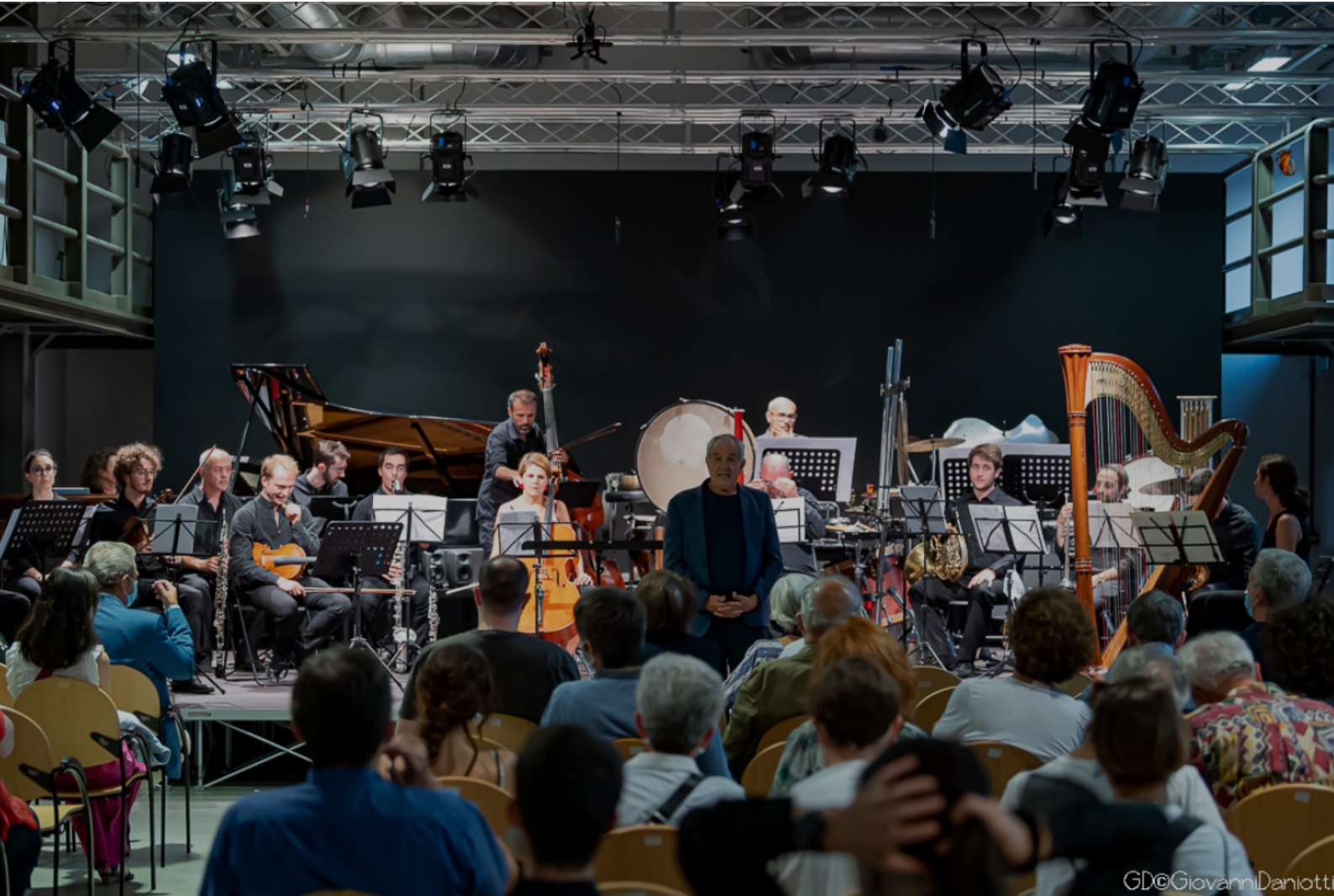
Concert in Milano, Sala Donatoni, Fabbrica del Vapore - 2023