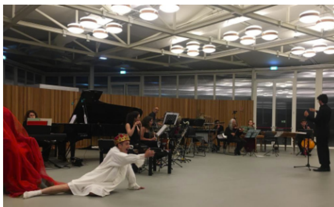
Maxwell Davies, Eight Songs for a Mad King - 2022

The best student is invited to conduct a concert in Milan in the Rondò 2025 season.