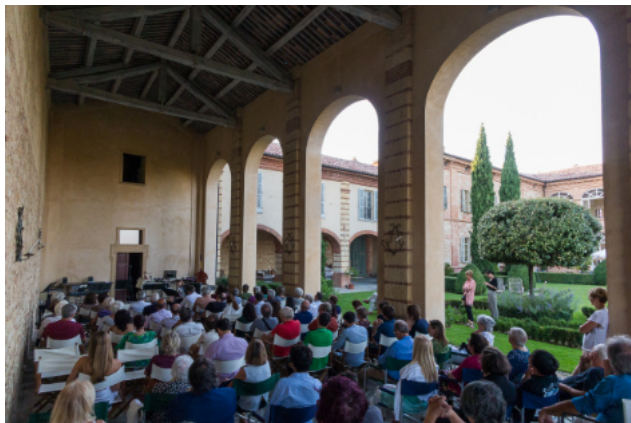
Concert in Grazzano Badoglio - 2023