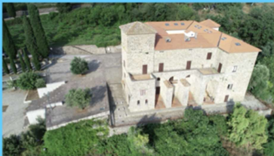
Baronial Palace of Torchiara, Festival Site

By car: A2 Salerno-Reggio Calabria motorway with exit at Battipaglia or Eboli