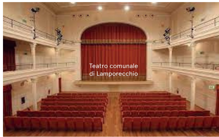
Teatro comunale di Lamporecchio